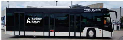
2017 Cobus 2700