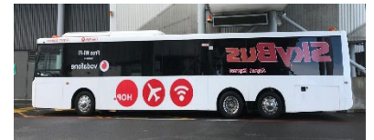
2011 Scania K320